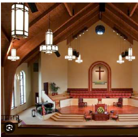
LED Church Lighting by Craft Metal Products