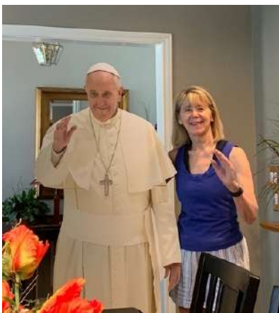
"Molto bene, Don!" Blessing the presentation