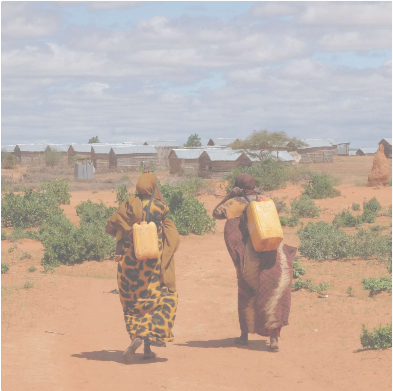
(Above): Ethiopia

God calls us as caretakers of the earth not simply to take the earth's resources for our own benefit, but to use the earth's resources to praise, reverence, and serve God.