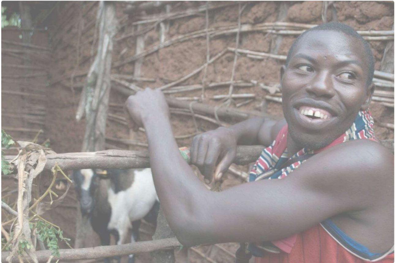
(Header): The view from Sacred Heart Jesuit Retreat House in Sedalia, CO.